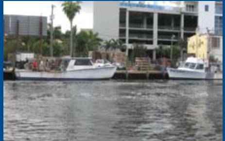
expanded site at 40 SW South River Drive