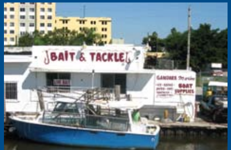
New Gandara Marine at 450 NW North River Drive