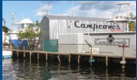
New Campeones Boatyard and Marina at 600 NW Seventh Avenue on the Seybold Canal