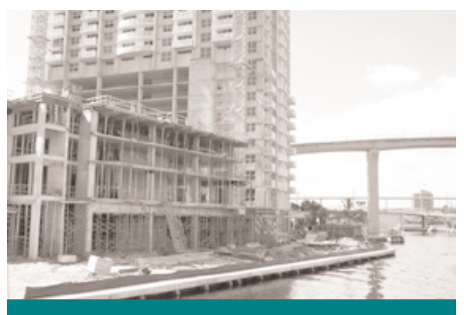
CONSTRUCTION PROCEEDS ON BRICKELL ON THE RIVER'S RIVERWALK. All new projects along the river are providing publicly accessible riverwalks.

unanimously adopted by the Miami River Commission, the Miami City Commission and the Miami-Dade County Commission in 2001. The plan is being put to work, as some greenway sections are under construction, with others about to break ground.