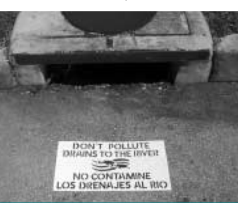
IN 2004, 75 OF THESE ADVISORY SIGNS were placed by storm drains along the Miami River as part of a public information program to discourage polluters.

Further funding has become available as residents approved on Nov. 2 additional money for stormwater improvement projects. The Miami River Commission, in partnership with Florida International University, installed environmental messages adjacent to storm drains throughout the river, warning against polluting near drains which flow into the river.