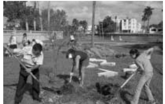
VOLUNTEERS FROM HANDS ON MIAMI and the Miami River Commission plant trees donated by Carnival Cruise Lines at a pocket park in the historic Grove Park neighborhood on NW South River Drive and NW 16th Ave.

In response to the concerns of the community, the Army Corps is prohibiting open-air drying of the sediments, which environmental