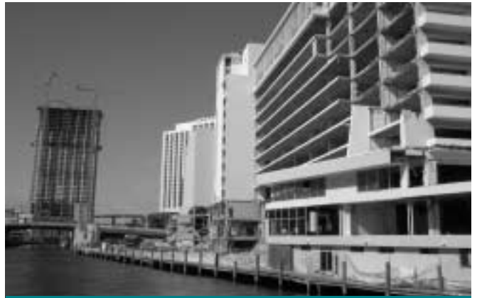
THE OLD DUPONT PLAZA WAS TORN DOWN to make way for twin residential towers and a riverwalk connecting the Miami River with Biscayne Bay. The Brickell on the River project is under construction in the background, just west of the Brickell Avenue Bridge.

Miami-Dade Water and Sewer Department, City of Miami and the South Florida Water Management District. The report (available at www.miamirivercommission.org ) contains 32 recommendations at an estimated cost of $18.4 million; $7 million of