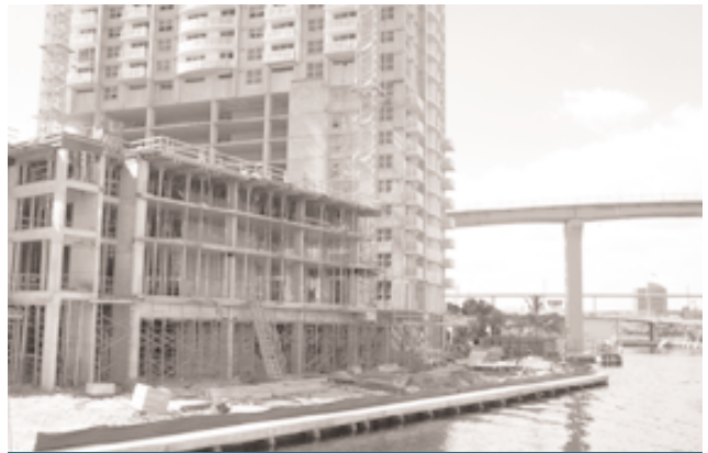
CONSTRUCTION PROCEEDS ON BRICKELL ON THE RIVER'S RIVERWALK. All new projects along the river are providing publicly accessible riverwalks.

The Miami River Greenway Action Plan, prepared by the Trust for Public Land, was