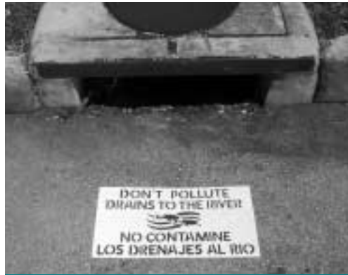
IN 2004, 75 OF THESE ADVISORY SIGNS were placed by storm drains along the Miami River as part of a public information program to discourage polluters.

Further funding has become available as residents approved on Nov. 2 additional money for stormwater improvement projects. The Miami River Commission, in partnership with Florida International University, installed environmental messages adjacent to storm drains throughout the river, warning against polluting near drains which flow into the river.