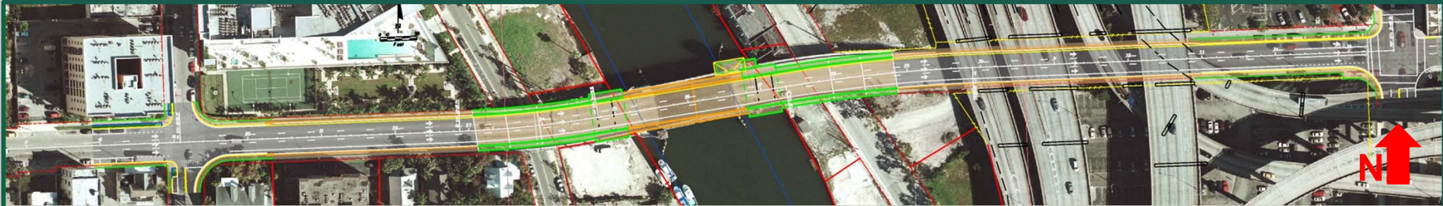
Alternative 1 Existing Alignment