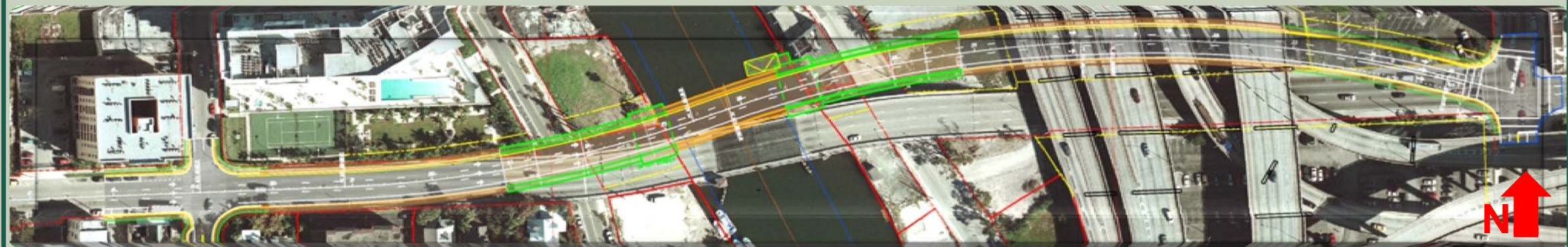
Alternative 3 North Alignment