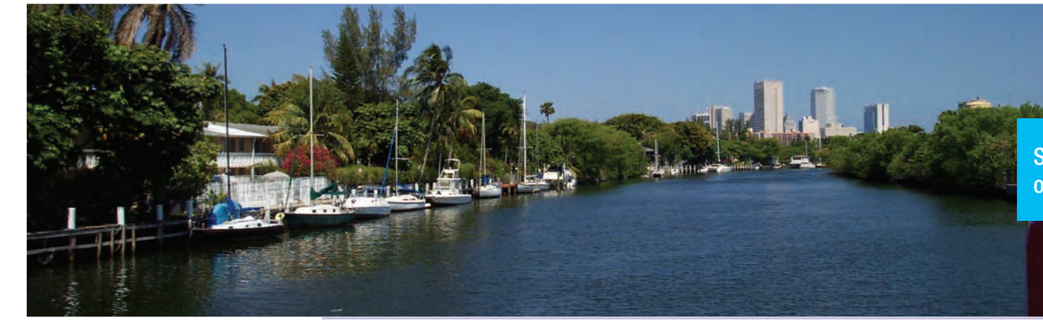
Spring Garden, a designated historic neighborhood, on the north shore of the "Middle River."