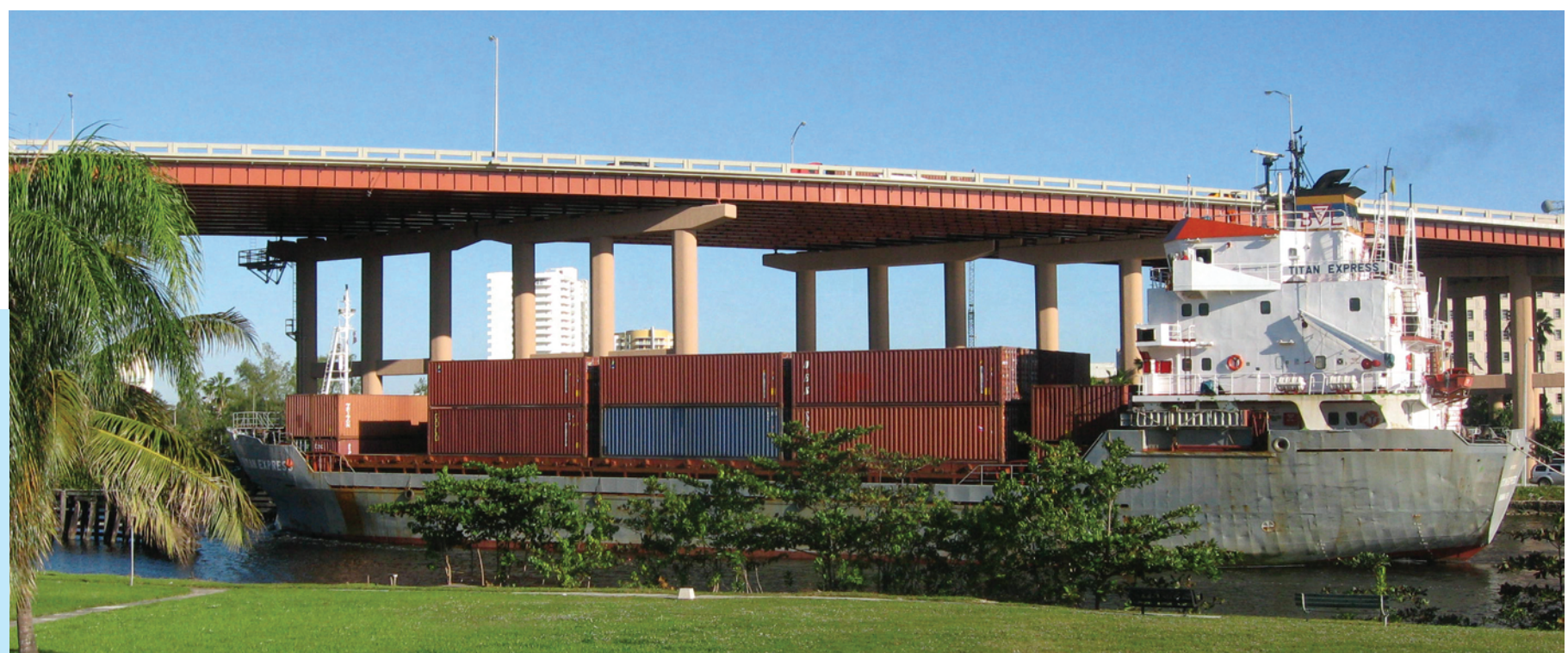
Cargo-loaded international shipping vessel navigating the dredged Miami River's federal navigable channel.