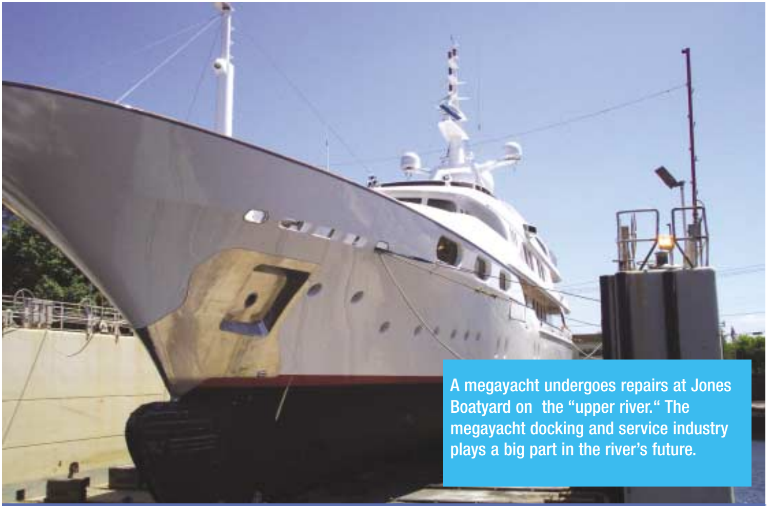
A megayacht undergoes repairs at Jones Boatyard on the “upper river.” The megayacht docking and service industry plays a big part in the river’s future.