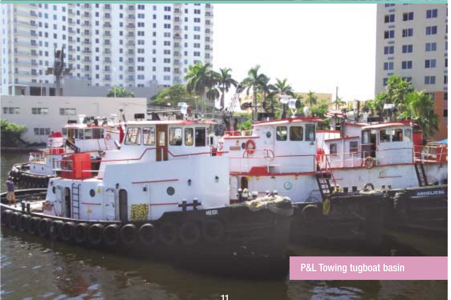
P&L Towing tugboat basin