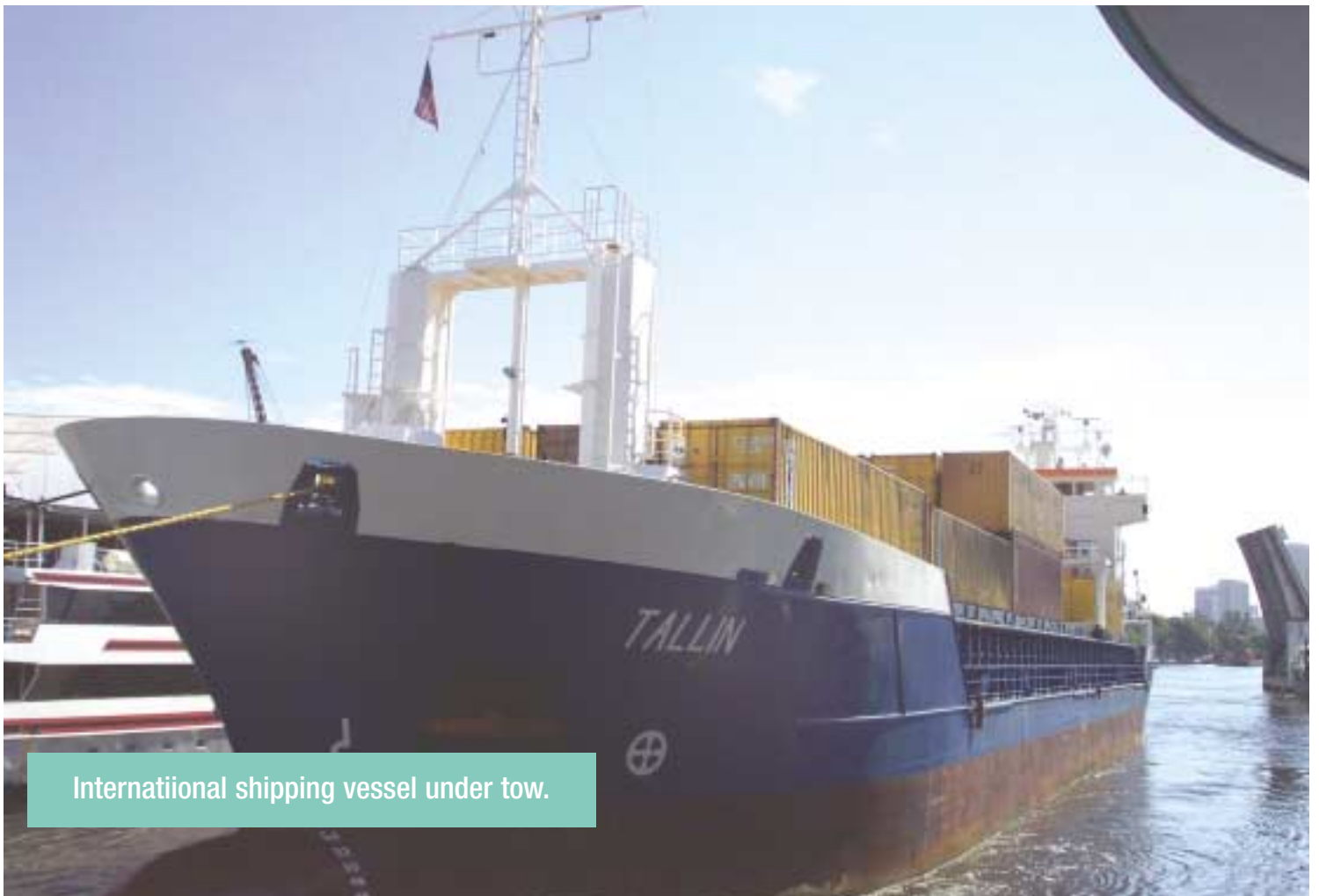
Internatiional shipping vessel under tow.