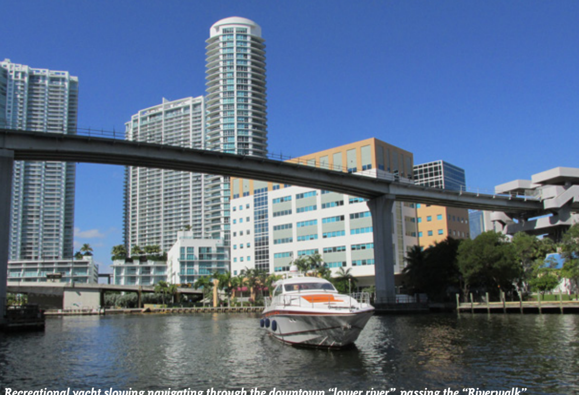
Recreational yacht slowing navigating through the downtown "lower river", passing the "Riverwalk" Metro-Mover Station, riverfront offices and residences.

public and private sector ss various riverfront issues mental to operations on the uality of the River, and the nation for residents, tourists one, the Miami River "VIP" 3 derelict vessels, 21 Miami ication volunteer events dumping, invasive species, ections of the Miami River, s, unclogging storm water ing hazard to navigation ami-Dade County, City of ate sector, and the fantastic work bringing these River