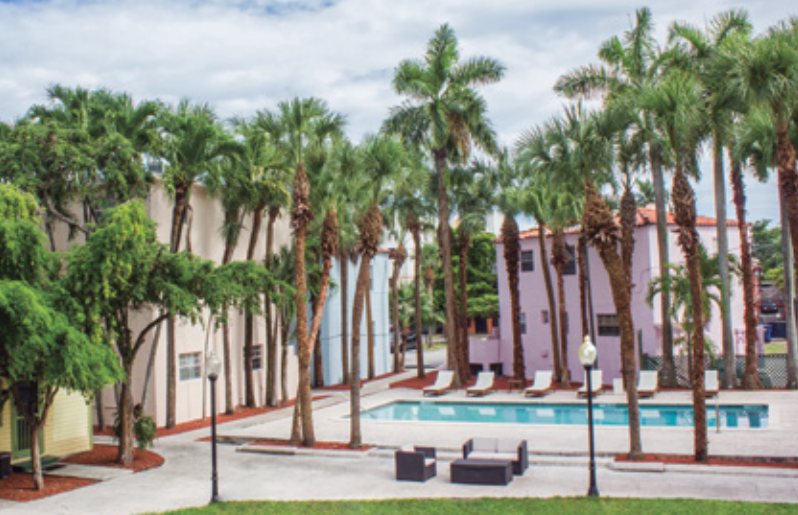
Historic Miami River Hotel's beautiful pool, landscaping and cottages designated on the National Historic Register.