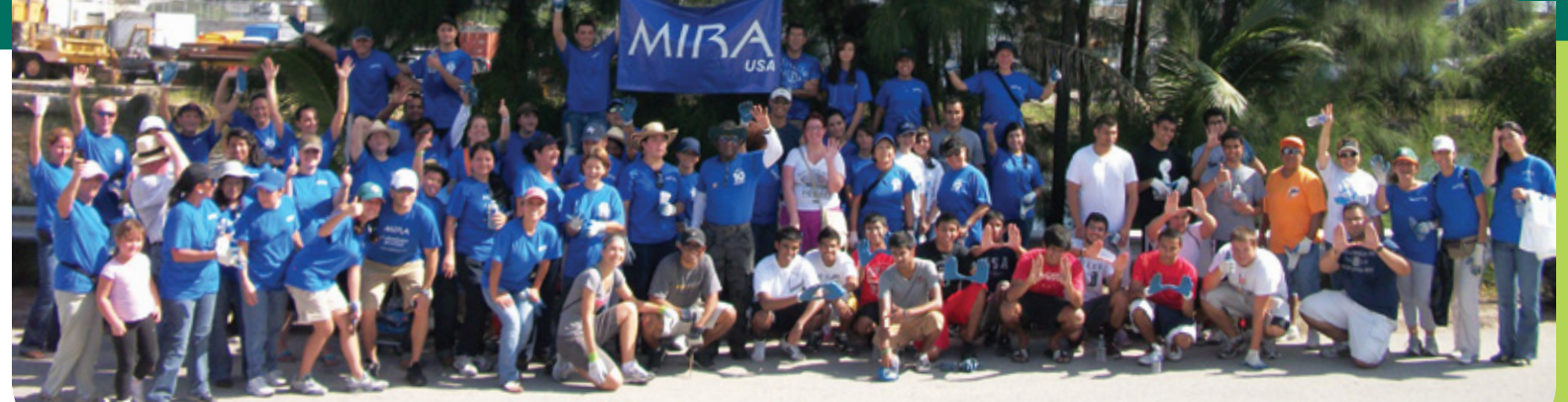
MIRA USA, UM and FIU volunteers beautifying the Miami River Greenway.