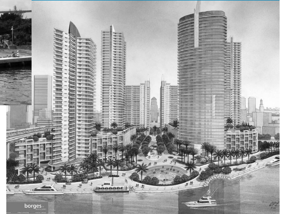
Below: Miami River Village, on the river's north bank just west of the Miami Avenue Bridge, is planned with 1,300 residential units in four stages.