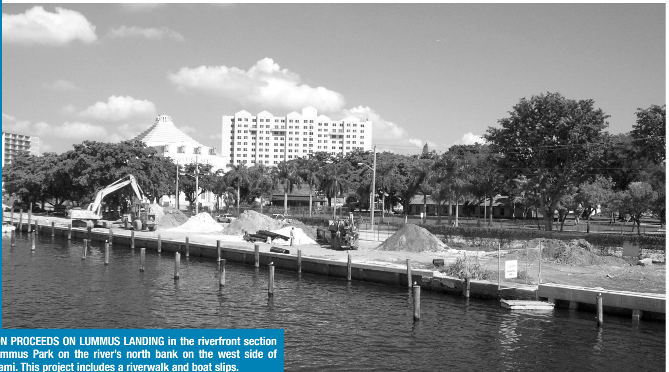
CONSTRUCTION PROCEEDS ON LUMMUS LANDING in the riverfront section of historic Lummus Park on the river's north bank on the west side of downtown Miami. This project includes a riverwalk and boat slips.