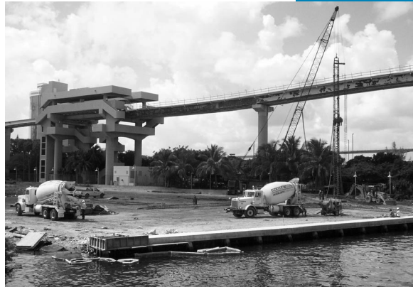
Left: After an October groundbreaking on the Brickell on the River project, construction is already in full swing.