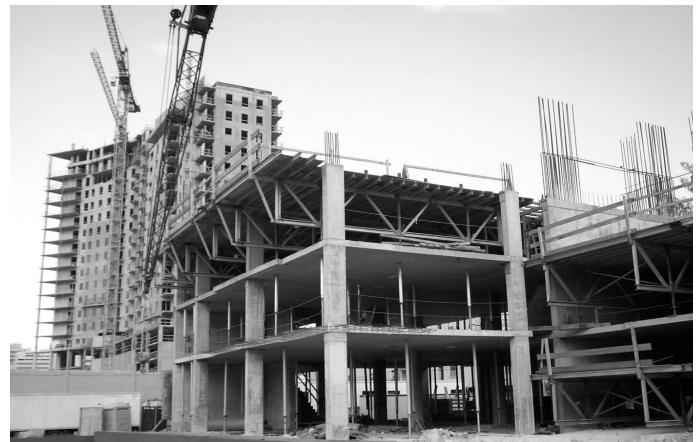
Top: Construction continues on Brisas Del Mar, a residential complex developed by the Gatehouse Group, while work proceeds on Neo Lofts, background.

THE DOWNTOWN TRANSPORTATION MASTER PLAN adopted by the City Commission in May 2003 set as a priority a downtown River Tunnel. The Miami River Commission conducted a cost analysis for the SW 12th Avenue and SW 27th Avenue bridges, that concluded that over a 70-year cycle, the tunnel options were $1.46 million less expensive than bridges.