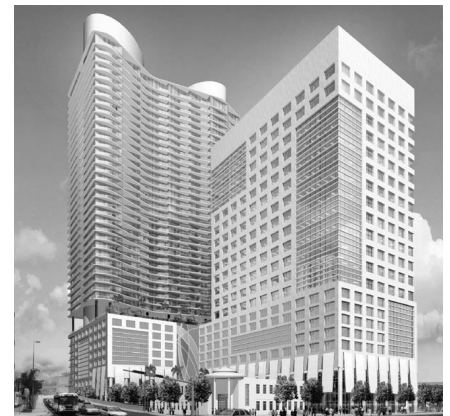
LATITUDE ON THE RIVER is a planned mixed-use development on the south bank near the SW 2nd Avenue Bridge, with a 42-story residential condo and a 22-story office condo, including retail space and a restaurant overlooking the riverwalk.

The commission considers the marine industry a vital contributor to the City of Miami's economy, as the marine industry and related