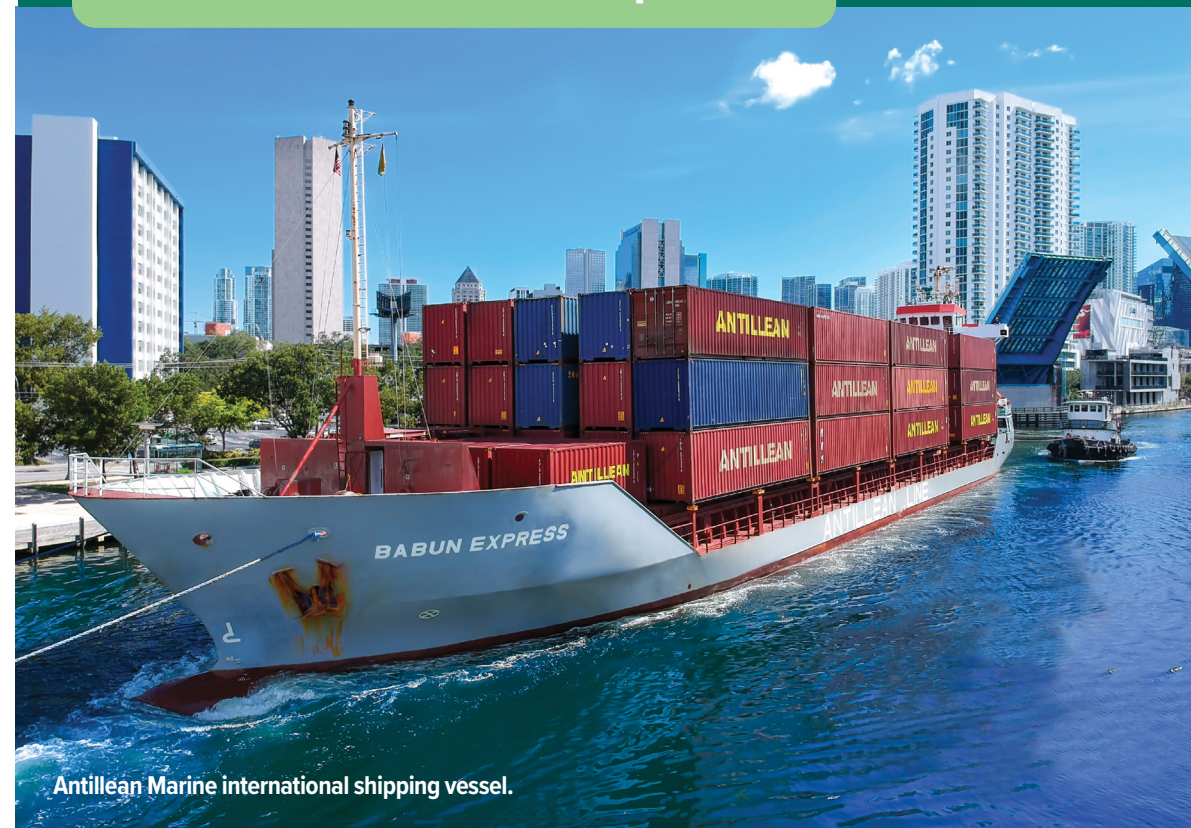
Antillean Marine international shipping vessel.