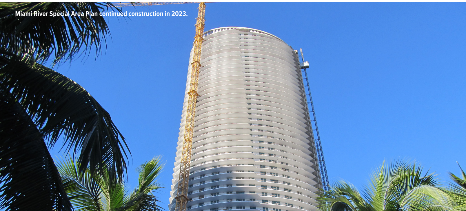
Miami River Special Area Plan continued construction in 2023.