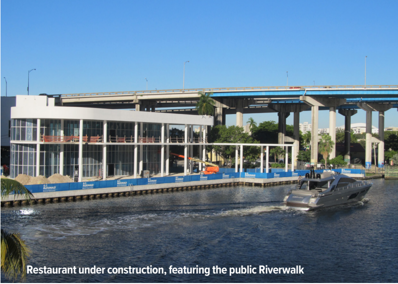
Restaurant under construction, featuring the public Riverwalk