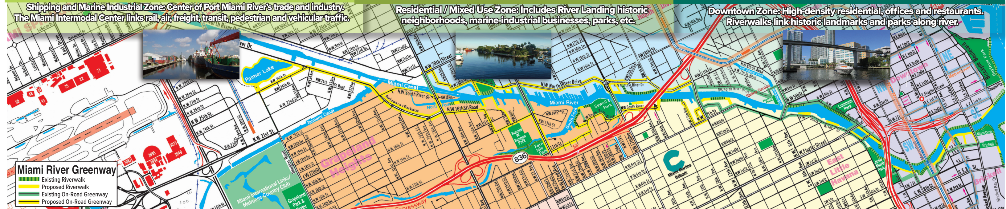
MIAMI RIVER GREENWAY'S TIMELINE

Downtown Zone: High-density residential, offices and restaurants. Riverwalks link historic landmarks and parks along river.