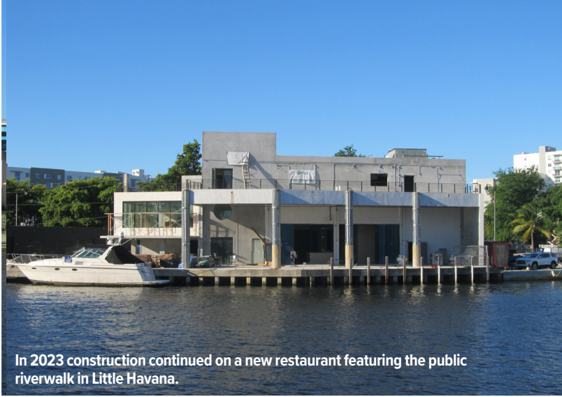
In 2023 construction continued on a new restaurant featuring the public riverwalk in Little Havana.